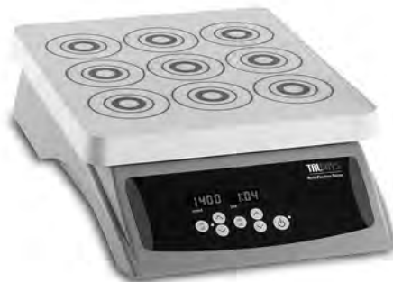
Advanced Multi-Position Stirrer 9