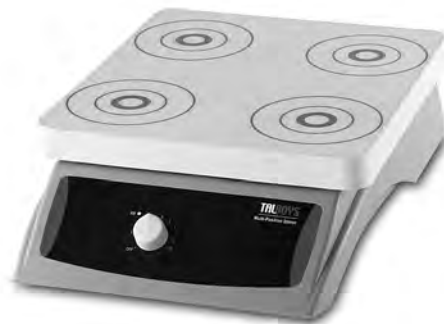
Standard Multi-Position Stirrer 4